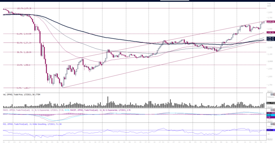
DFM GENERAL INDEX – DAILY CHART