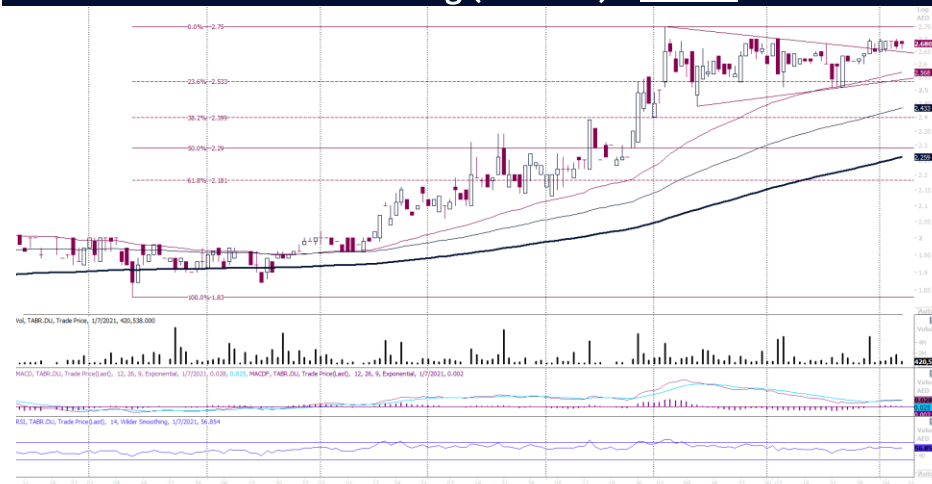
National Central Cooling (Tabreed) – DAILY CHART

The Index has been in an uptrend and respecting the uptrend channel. However, the RSI reached the overbought area while the Index is testing the upper side of the bullish channel. We are expecting a correction from here.